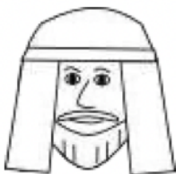
James (son of Alphaeus)