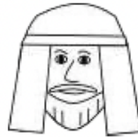
James (brother of John)