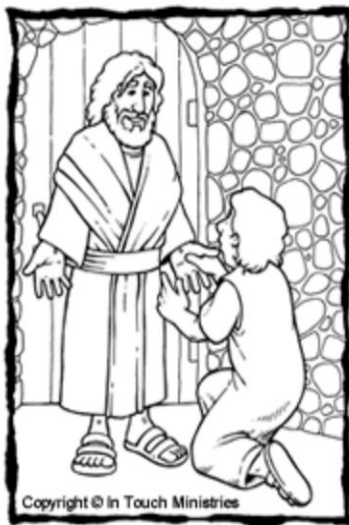
"Stop doubting and believe." John 20:27 (NIV)

The Doubting Disciple John 20:18-31 (NIV)